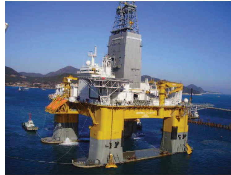
"Deep Sea Atlantic" (offshore-platform), Korea

Swimming offshore-platforms producing and storing oil.